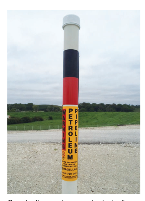
Our pipeline markers can be typically identified by the black and red bands at the top.

Magellan Midstream Partners, L.P. is a publicly traded limited partnership, principally engaged in the transportation, storage and distribution of refined products and crude oil. Magellan operates a 9,800 mile refined products pipeline system with 54 connected terminals and two marine terminals (one of which is owned through joint venture) and a 2,200 mile crude oil pipeline system.